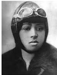
Bessie Coleman, 1921

Bessie Coleman was born in a one-room, dirt-floored cabin in Atlanta, Texas on January 26, 1892. Her parents were the children of enslaved people and couldn't read or write. When Bessie was eleven years old, her father left the family, and Bessie's mother and two older brothers went to work, while Bessie stayed at home to take care of two younger sisters.